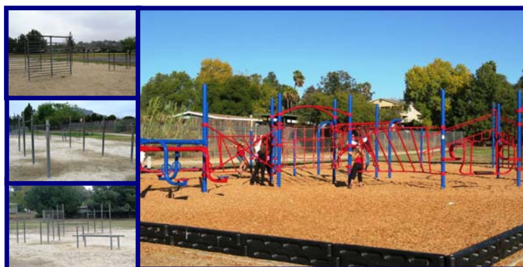
Before/After W.D. Hall Playground Completed May 2009