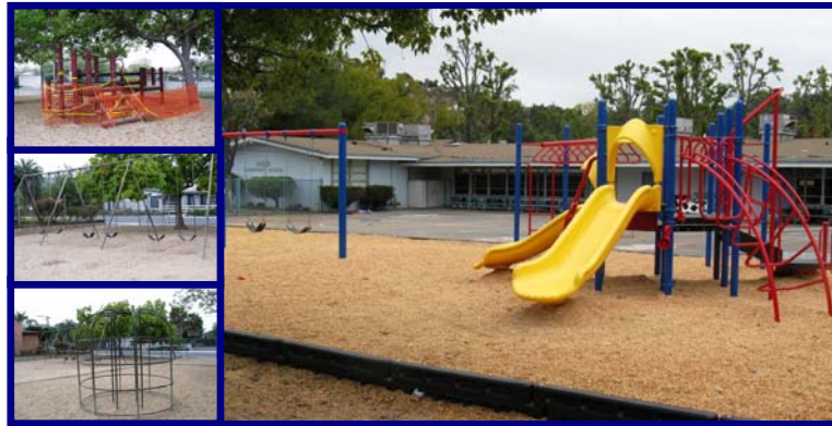
Before/After Anza Playground Completed April 2009