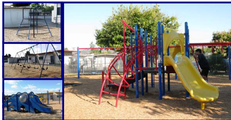
Before/After Naranca Playground Completed April 2009