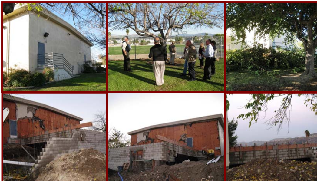
Before/During Construction, Flying Hills, MPR Remodel Estimated Completion, March 2010 Top Center: COC Site Visit prior to construction