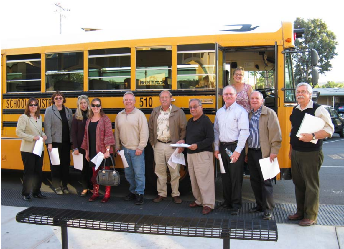
Citizens' Oversight Committee project bus tour January 2009