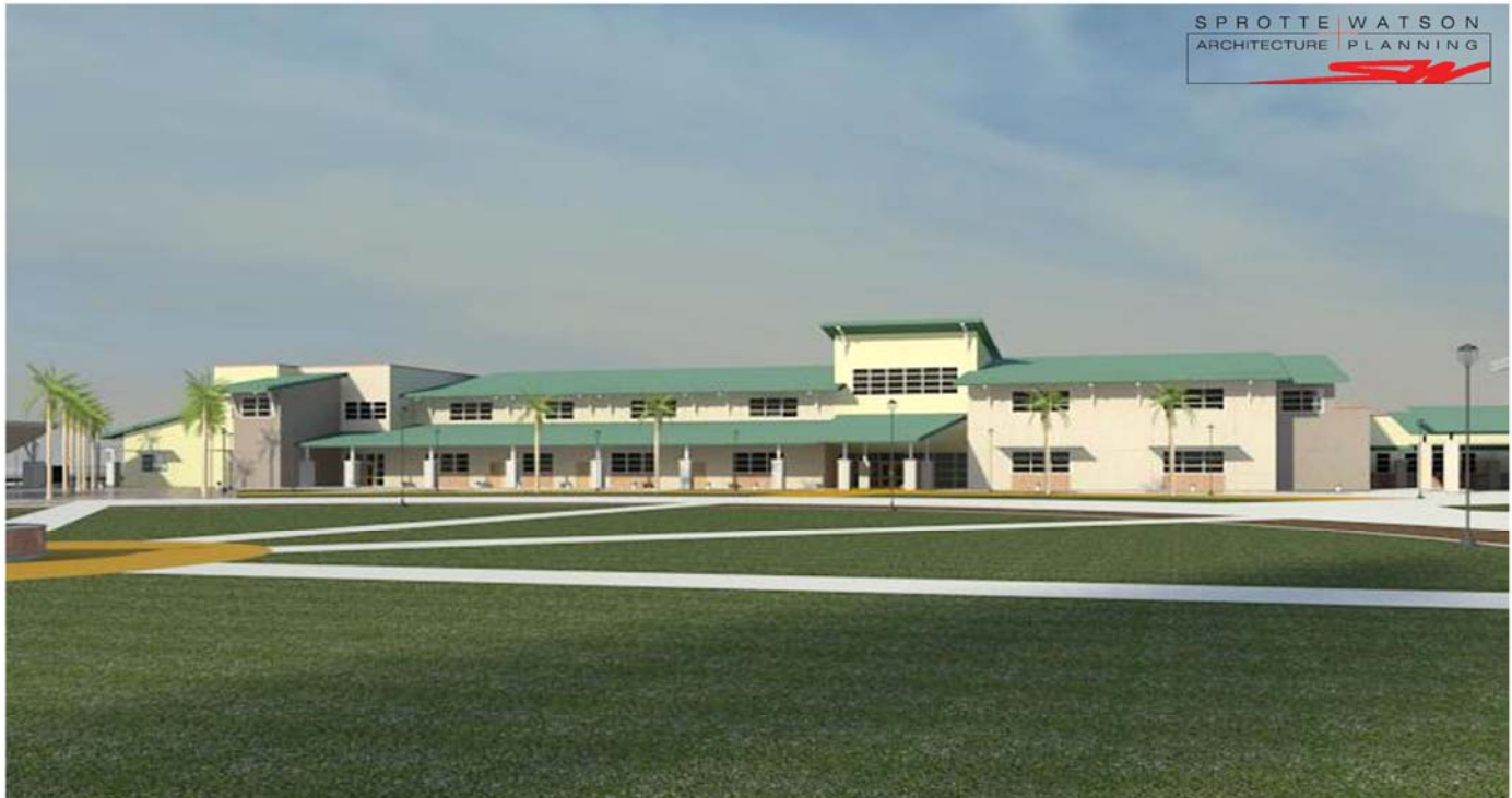
Future Cajon Valley Middle School 20-Classroom Building, Library, and Serving Kitchen