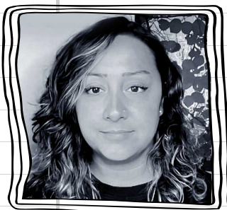
PTO VOLUNTEER COORDINATOR