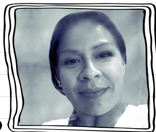
PTO VICE PRESIDENT